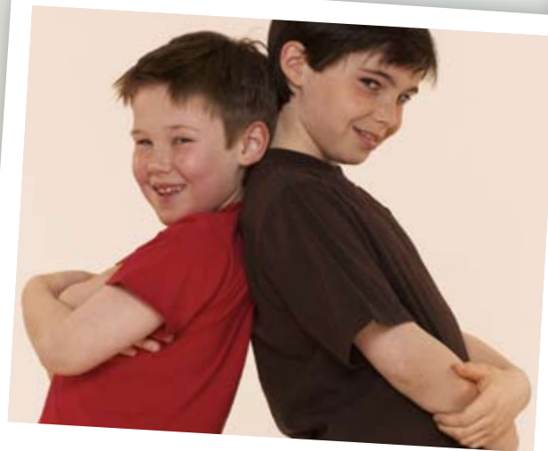
Meet Other Kids